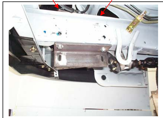
Figure 3 – Drivers Side