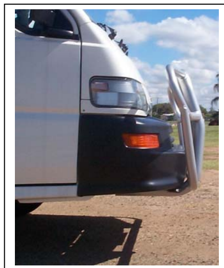
Figure 4 – Type 8 Alignment