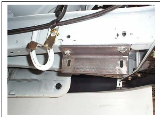
Figure 2 – Passenger Side